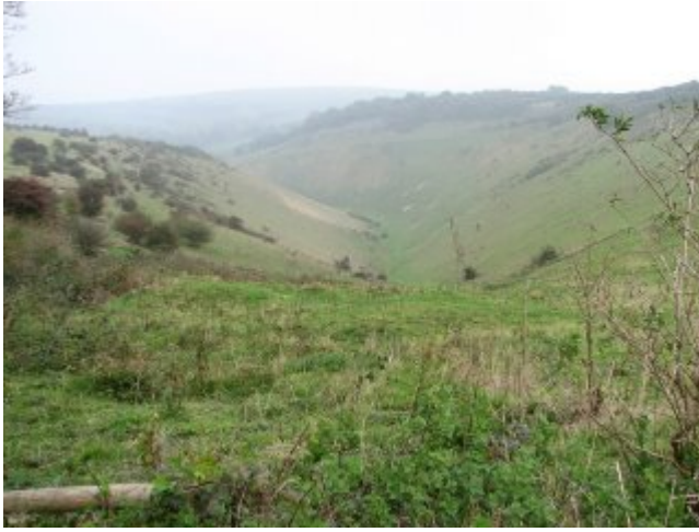
Looking back into the dry combe that is Devil's Dyke.

GF had walked along the rim on the left and was about to set out along the southern rim (on the right).