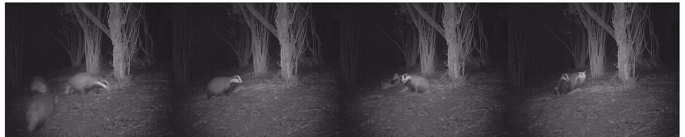
BADGERAMA I recently set up an automatic camera in the badger sett above us, writes Roger Loveless. The result was quite interesting so I thought fellow Fulkingites might like to see it too. The camera collected a series of 10 second clips from 4:40 pm to 3:40 am (selection above). I have compiled them into a single video which can be downloaded from or viewed on the village website: http://fulking.net/badgers-in-fulking/