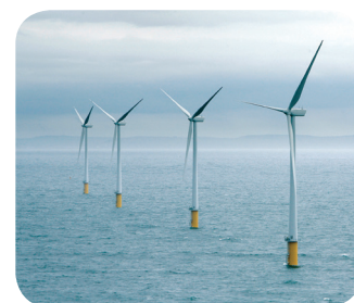
Robin Rigg Offshore Wind Farm, Solway Firth. For illustrative purposes only

E.ON is developing a proposal for an offshore wind farm on a site 13-23km off the Sussex coast, capable of generating electricity for around 450,000 homes each year. Twelve exhibitions will be held in coastal towns and rural areas near the proposed cable route as part of a formal consultation from February to April 2012. Visit E.ON's public exhibitions at The Steyning Centre (Coombe Court, Steyning) from 12pm-8pm on Wednesday 29 February; Albourne Village Hall (The Street, Albourne) from 10am-6pm on Saturday 17 March; or Henfield Village Hall (Off High Street, Henfield) from 11am-6.30pm on Tuesday 27 March. See www.eon-uk.com/rampion for more information.