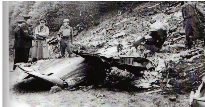
PC Boon discusses the wreck with The Army. From Carole Hampson's 'Poynings Yesterday', just launched, available from the Royal Oak, Poynings

Blitz over Sussex is available from Middleton Press in Midhurst, 01730 813169.