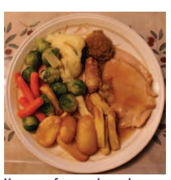
Yummy – for one day only. What to do with it all on Boxing Day... and the day after that... and the day after that?

11. Put the pan in oven - make sure it has a heatproof handle!