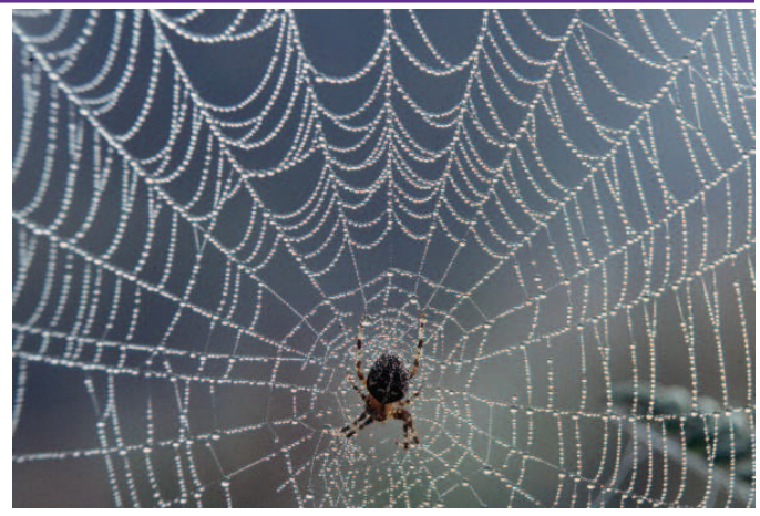
It's been a bumper year for spiders and butterflies. You'll probably notice those big hunter spiders appearing in your bath, but don't kill them, they are an important part of the ecosystem. Look out for those beautiful webs on clear mornings with dew sparkling on them.

We've signed up for Good Energy, which provides all your energy from 100% renewable sources. It's quite easy and the customer service people are very helpful. Do you bit for the planet – go online and do it today! www.goodenergy.co.uk Chris Gildersleeve, 857552