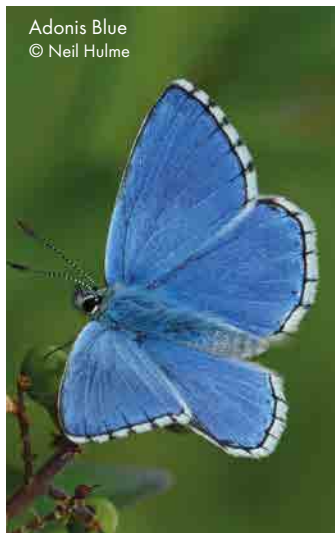
Adonis Blue