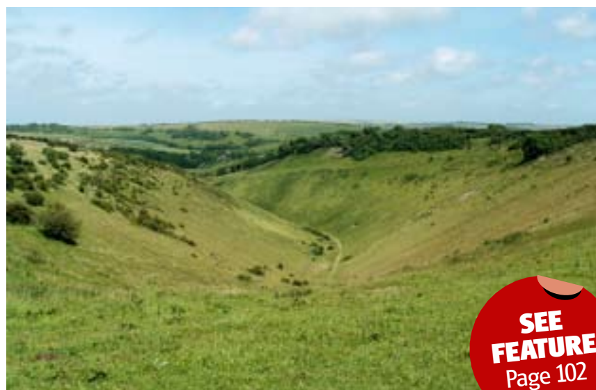
The spectacular Devil's Dyke was cut by glacial meltwaters.