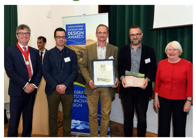
The Innovation Award winners pick up their trophy